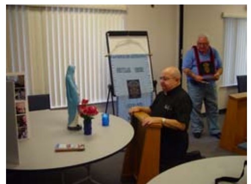
Our Lady of Sorrows Community Lady Lake, FL