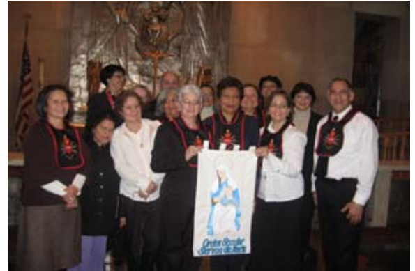
Comunidad Nuestra Senora de la Providencia Hartford, CT