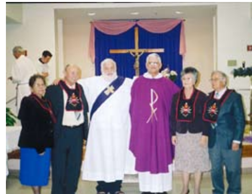
San Peregrino Comunidad Kissimmee, FL