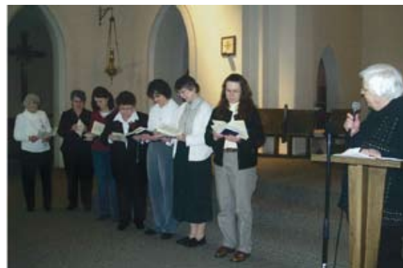
St. Peregrine Community Rice Lake, WI