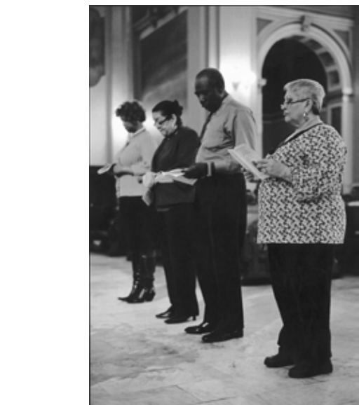
Our Lady of Sorrows Community Chicago, IL